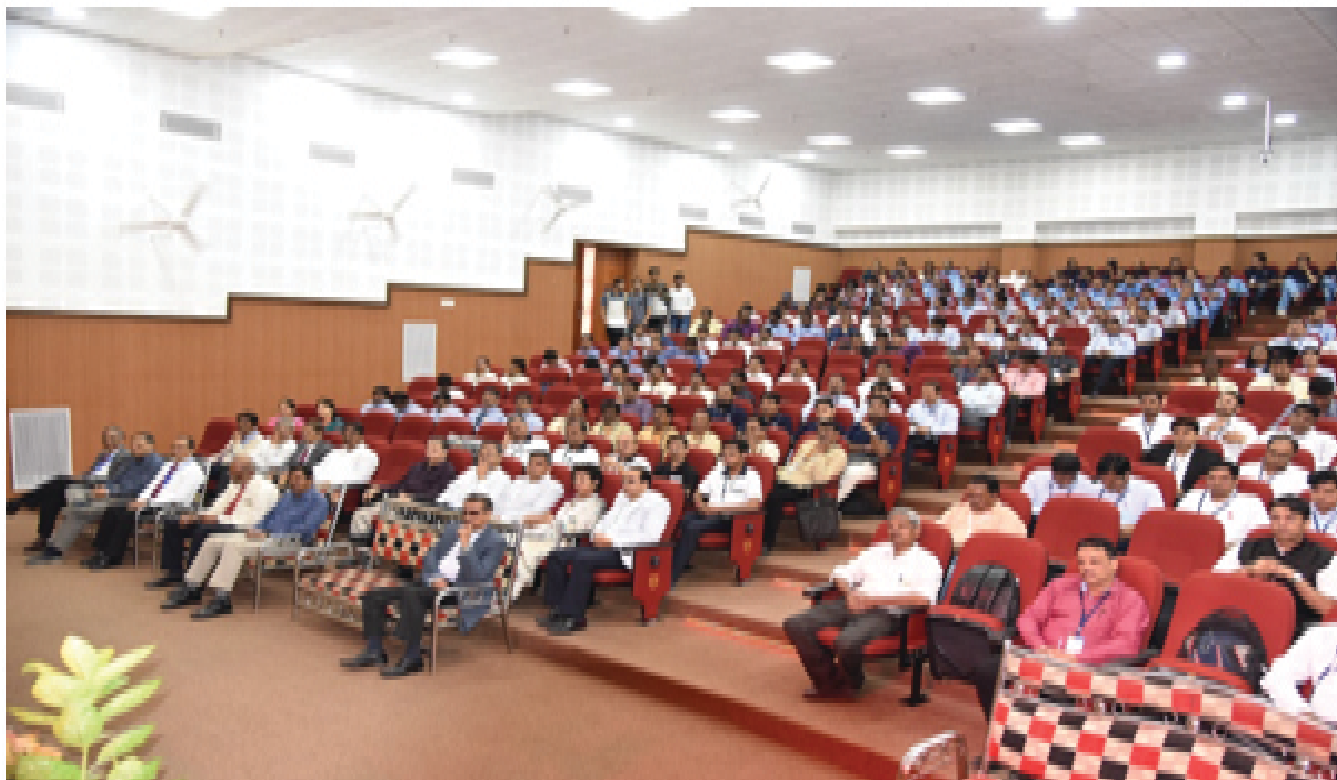
Large gathering of participant in CCQC - 2018