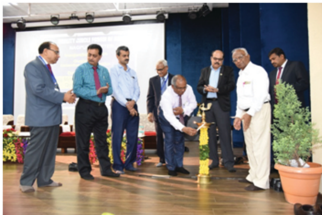
Inauguration of CCQC-2018

CCQC-2018 held at Vanamati, Nagpur on 30th September 2018. Total 114 teams, comprising of 528 participants from 59 organizations.