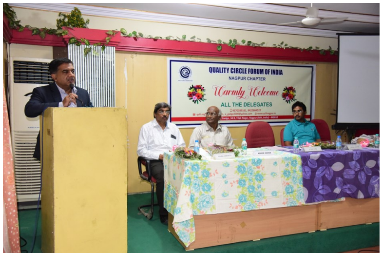
Chief guest shared his valuable thoughts on importance of Quality Circle, TQM, Quality by giving various examples.