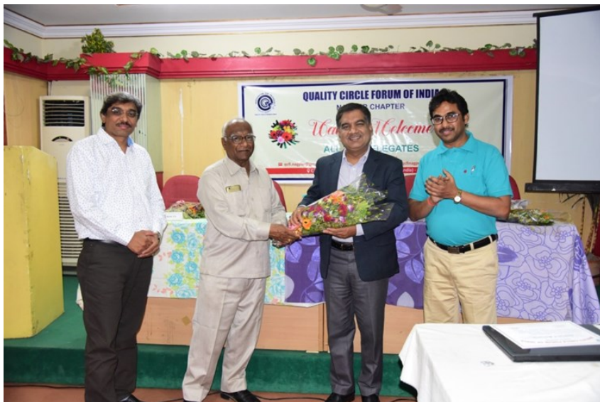
Chief Guests felicitated with shawl and bouquet.