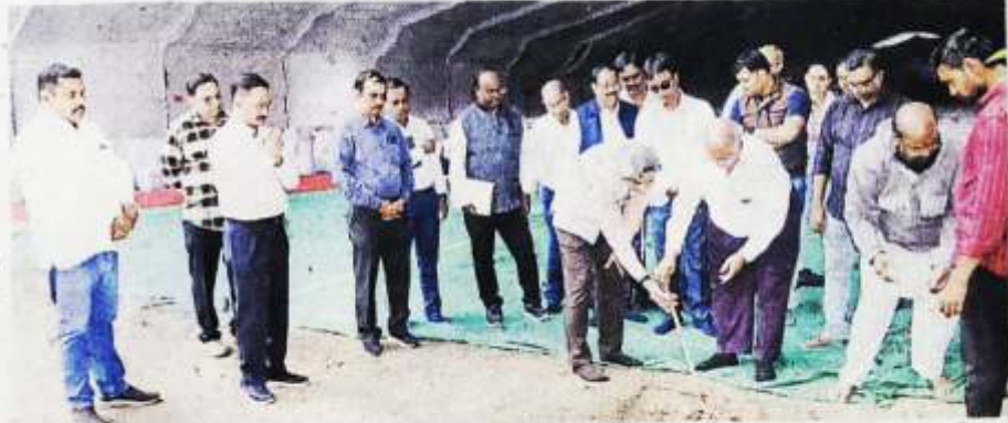
क्वालिटी महाकुंभ की तैयारी के लिए पूजा-अर्चना करते हुए अतिथि