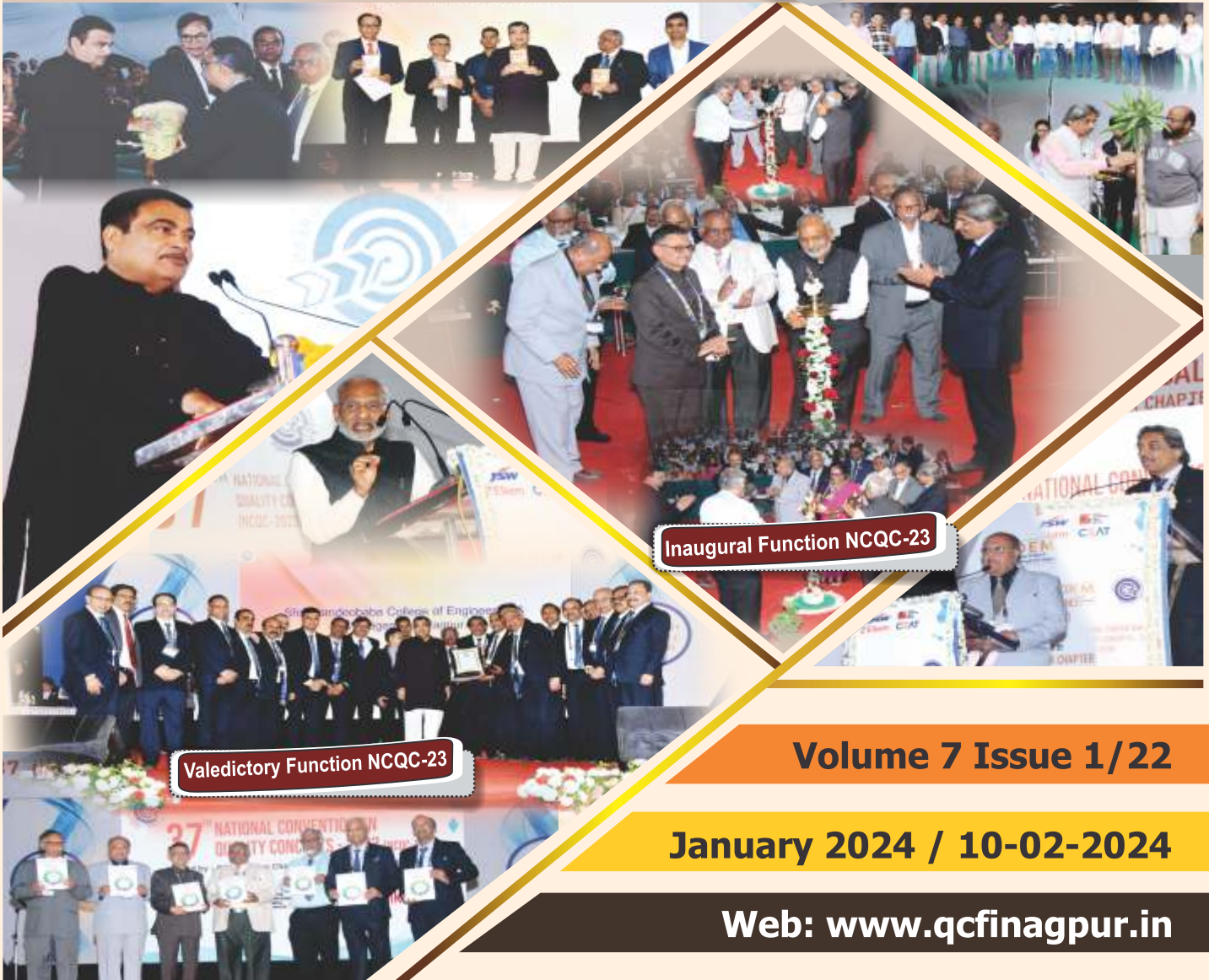
Inaugural Function NCQC-23